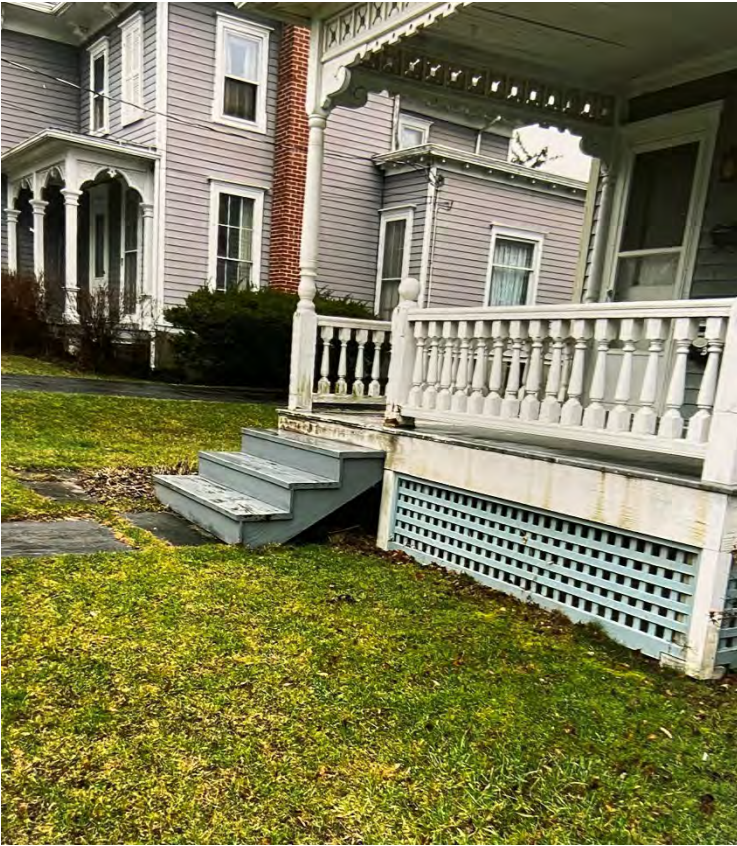
219 Clinton Street Front Porch